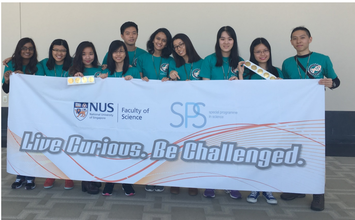
Figure 2. Team members representing NUS at the iGEM conference.